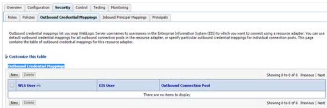
Fig.2 Shows setting for com.ofss.digx.connector.rar

Click Security->Outbound Credential Mapping. This will display Outbound Credential Mappings table.